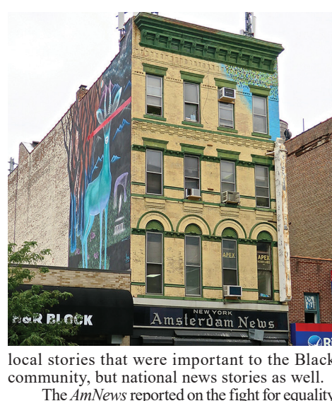
local stories that were important to the Black community, but national news stories as well. The AmNews reported on the fight for equality during the Jim Crow era, the events of the Civil Rights Movement, the Montgomery Bus Boycott